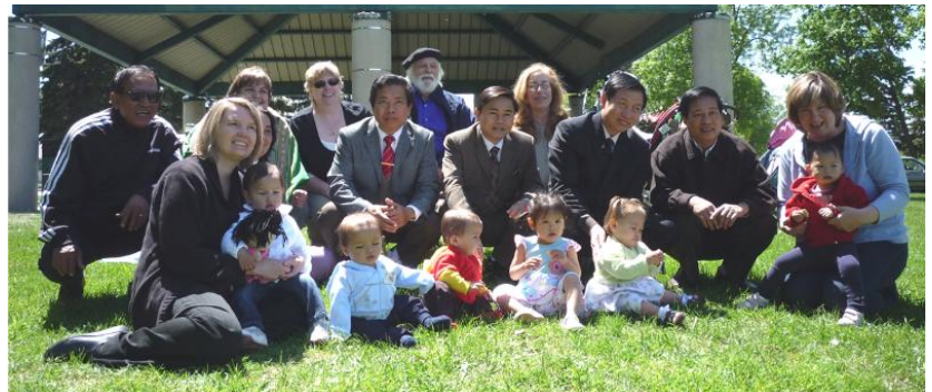
Children adopted from Hoa Binh & Tra Vinh living in the Ottawa region along with the Vietnamese delegation from these two provinces, parents and the TDHO staff.